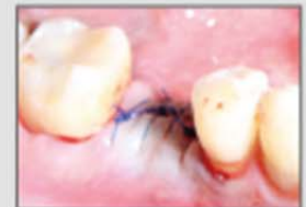
Fig. 3: Wound-closure with Vicryl 5/0 sutures!