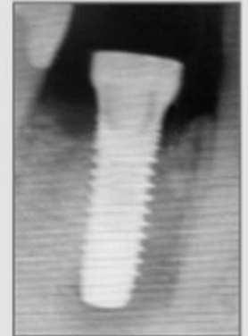
Fig. 7: Detail of the Radiograph after the GBR.

An alginate impression was taken in order to fabricate a special tray for the secondary master impression.