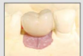
Fig. 19: Completed restoration