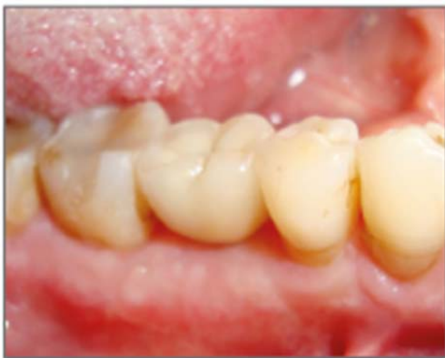
Fig. 21: Cementation of completed implant crown #46

As you can see in the illustration of Fig. 23 the bone graft has completely healed within the osseous site.