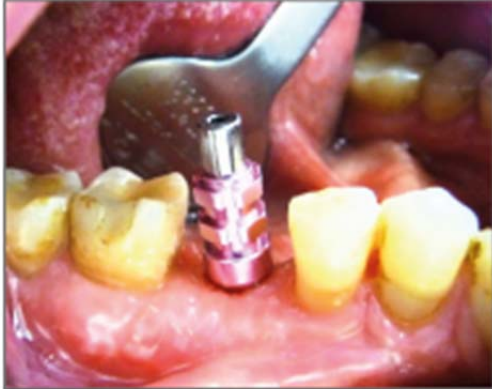
Fig. 11: Screw-retained impression coping in situ

A secondary impression was taken by using a special tray and poly-ether material.