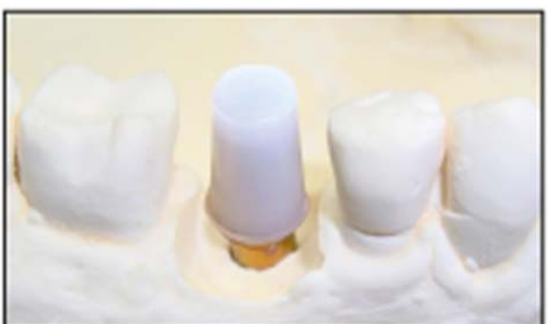
Fig. 16: Plastic cylinder