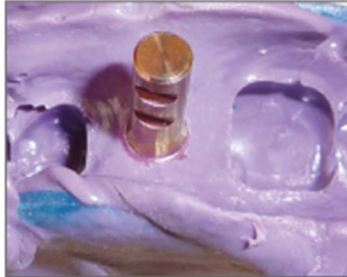
Fig. 12a: Detail of the impression

A working model with the implant replica was fabricated.