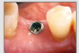
Fig. 10: Implant after osseointegration