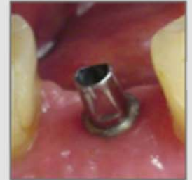
Fig. 20: Straight abutment in situ.