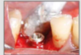
Fig. 1: Final position of the implant

The implant surgery was uneventful. After a small crestal incision and raising a small flap a Biodenta ® -Tissuelevel-Implant (ø4.1/12mm) was placed and submerged. The primary stability was optimal (35 Ncm). The bone volume was more than sufficient and therefore no grafting was required. Finally the wound was closed with Vicryl 5/0 sutures.