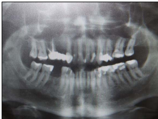
Fig. 4: Panoramic radiograph at examination

The patient is in generally good health. A thorough dental examination confirms healthy periodontal tissues, optimal restorations and no decay present.