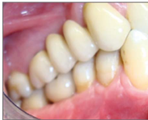
Fig. 22: Review of the occlusion