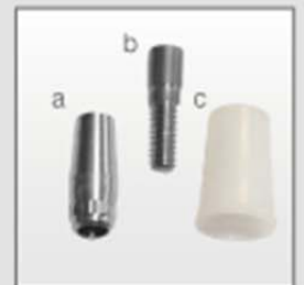
Fig. 13: Prosthetic components: