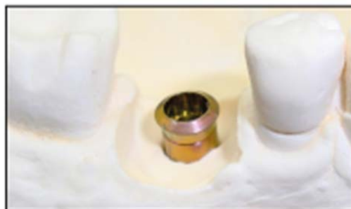
Fig. 15: Implant replica