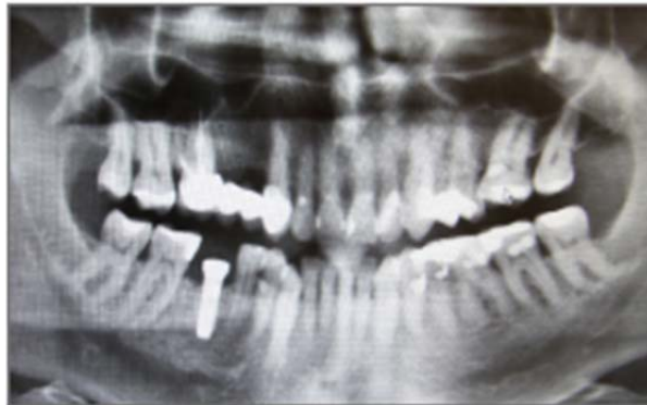
Fig. 6: Panoramic radiograph two months after implant insertion.

After raising a small sub-periosteal flap moderate circular and horizontal bone loss was detected around the implant.