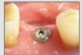
Fig. 9: Implant after osseointegration