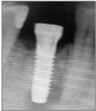
Fig. 5: Follow-up radiograph

A follow-up review was conducted and a peri-apical radiograph was taken revealing peri-implantitis surrounding the implant #46. The peri-apical as well as the panoramic radiograph (Fig. 5 and 6) shows 3 mm of bone loss mesial and distal of the implant. The patient has no discomfort to date.