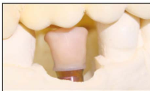
Fig. 17: The milled and coloured coping is ready for the porcelain application with „ceramics 2in1“.