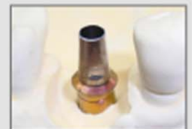
Fig. 18: Straight abutment