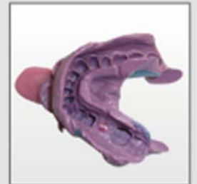
Fig. 12: Impression with poly-ether material

For the direct porcelain overlay of the Zirconia coping the ceramics2in1 - porcelain from Biodenta was used. Ceramics2in1 can be used for firing on titanium and Zirconia.