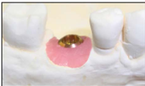
Fig. 14: Model with gingival mask