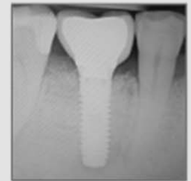
Fig. 23: Radiograph after the delivery of the implant crown.