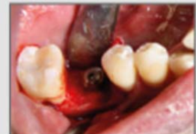
Fig. 2: Closure screw installation