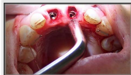
Fig. 8: Implant placement