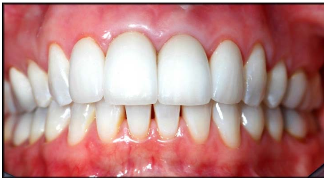
Fig. 18: Final Crowns

Finally, the crowns were placed with 'TempBond Clear' by Kerr, clear temporary cement (Figs. 17 and 18). This material allows for retrievability and access to the abutment. Additionally, it allows one to monitor the tissue adaptation and functionality of the restorations allowing for changes, if needed, prior to finalization. The result was amazingly beautiful. The patient was extremely happy with the results of the treatment. She was examined again 10 days post-operatively.