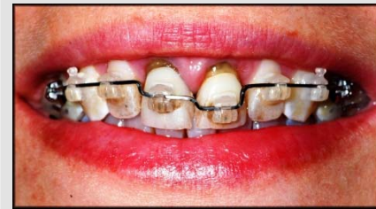
Fig. 5: Orthodontic treatment

Prior to starting the orthodontic treatment, it should be noted that a waxed model representation of the final esthetic case was constructed (Fig.6). This would ensure that the patient was accepting of the final esthetics and provided a template for immediate temporization following implant placement. We would thus have an adequate provisional fabricated to be placed on the teeth. The patient was evaluated at the end of orthodontic treatment, prior to removal of any ligatures and wires, to ensure that we had adequate movement of the teeth with attending bone to be able to place the implants. All practitioners also ensured that the surgical and restorative sites were as desired. They were asymptomatic, without drainage, and tissue health was again highly well developed and maintained by the patient. A wire splint was placed on the palatal aspect of the teeth. Final assessments were made. Surgical and restorative preparations and coordinated appointments were made for the patient. Implants were placed by the surgeon (Figs. 7 and 8) and the patient was then immediately sent to my clinic for placement of temporary abutments. At that time, an immediate implant level impression was taken with the open tray