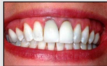
Fig. 3: Pre op