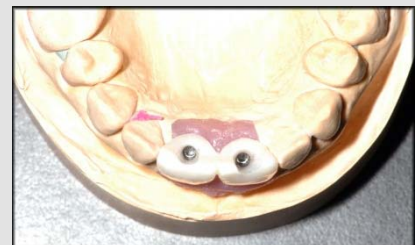
Fig. 14: Temporary bridge