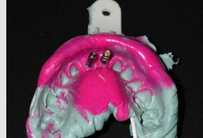
Fig. 9: Impression Technique

The patient was monitored periodically and it was decided that a very slight gingival re-contouring needed to be done. This was accomplished from the distal of #6 to the distal of #11. The re-contouring allowed for a slightly better esthetic presentation and to bring the tissue height more in line with the biologic width considerations. Upon healing of the tissue,