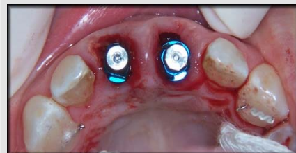
Fig. 7: Implant placement