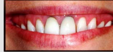
Fig. 1: Pre op