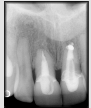
Fig. 2: Pre op