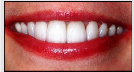
Fig. 19: 1 year post op