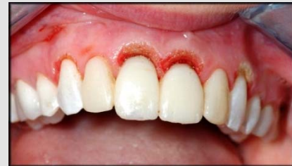
Fig. 13: Laser Gingivectomy

The abutments and crowns were placed in the mouth and verified for fit radiographically. The veneers were also verified for fit and then shown to the patient for esthetic approval. The veneers were bonded in place using clear 'Insure' resin cement by Cosmedent. The 'Hybrid' abutments were screwed into place and torqued to 35 ncm. At the time of placement of the 'Hybrid' abutment, a cotton pellet was placed in the screw access space followed by a light cured onlay temporary material fabricated by 'Cosmedent'. This allows for easy retrievability, if needed. It is also hand sculptable to ensure that there is no impingement on the internal aspects of the crown and serves the purpose very well.