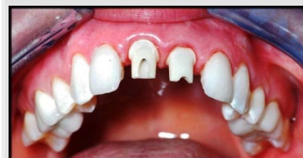
Fig. 16: Hybrid abutments