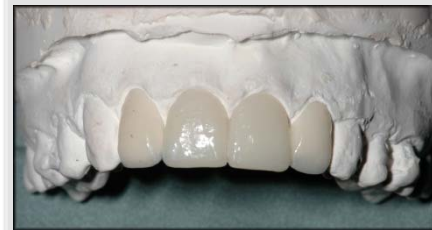
Fig. 6: Waxed model